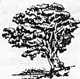
River Red Gum

Travelling across country to Learmonth we stopped for lunch on the shore of the now dry Lake Learmonth, recent winter rain only filling a few of its channels. At the rear of the old shire offices in Learmonth is an outstanding example of the Italian Cypress Cupressus sempervirens —perhaps 20m in height, its attractive grey-green foliage belying the presence of a dusty entanglement of branchlets within. According to the Encyclopaedia Britannica , Italian Cypress is used by some cultures as a symbol of death and immortality, a foreboding choice by the then civic leaders as new offices opened in Wendouree in 1964.